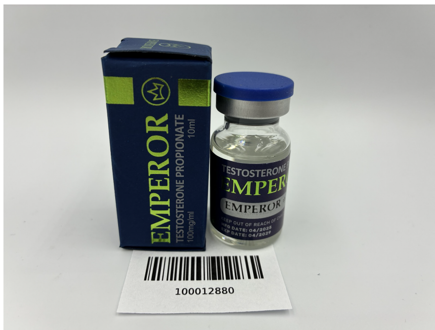
Photo of the test sample

The test sample was applied in the amount of 3 \mu l to the BioBasic 8 Thermo Scientific column. During the analysis with the method a linear gradient in the solutions of H 2 O and Acetonitrile with the addition of 0.1% trifluoroacetic acid, a peak of the sought substance appeared. Its concentration, when compared to the reference chromatogram, is 101,90mg/ml. The measurement error is + - 0,05mg. The actual state of the sample sent before the test is presented on the photo below