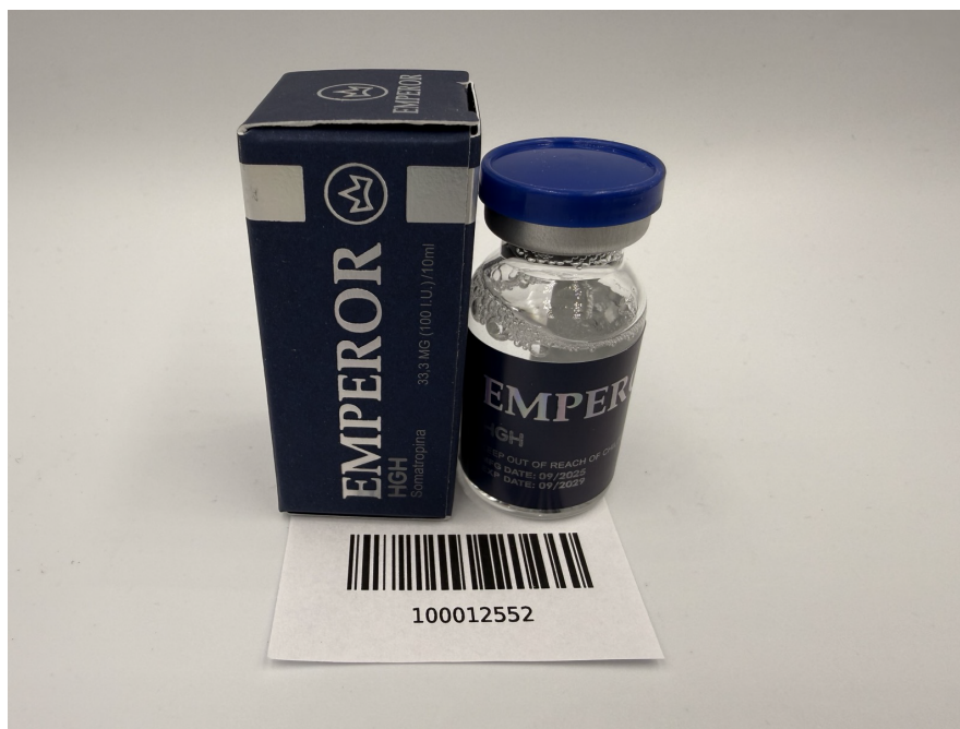
Photo of the test sample

The test sample was applied in the amount of 3 \mu l to the BioBasic 8 Thermo Scientific column. During the analysis with the method a linear gradient in the solutions of H 2 O and Acetonitrile with the addition of 0.1% trifluoroacetic acid, a peak of the sought substance appeared. Its concentration, when compared to the reference chromatogram, is 3,69mg/ml. The measurement error is + - 0,05mg. The actual state of the sample sent before the test is presented on the photo below.