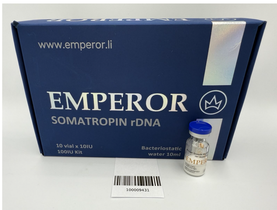
Photo of the test sample

The test sample was applied in the amount of 3 \mu l to the BioBasic 8 Thermo Scientific column. During the course of the analysis with the method a linear gradient in the solutions of H 2 O and Acetonitrile with the addition of 0.1% trifluoroacetic acid, a peak of the sought substance appeared. Its content, when compared to the reference chromatogram, is 3,80mg. Height the measurement error is + - 0,05mg. The actual state of the sample sent before the test is presented on the photo below