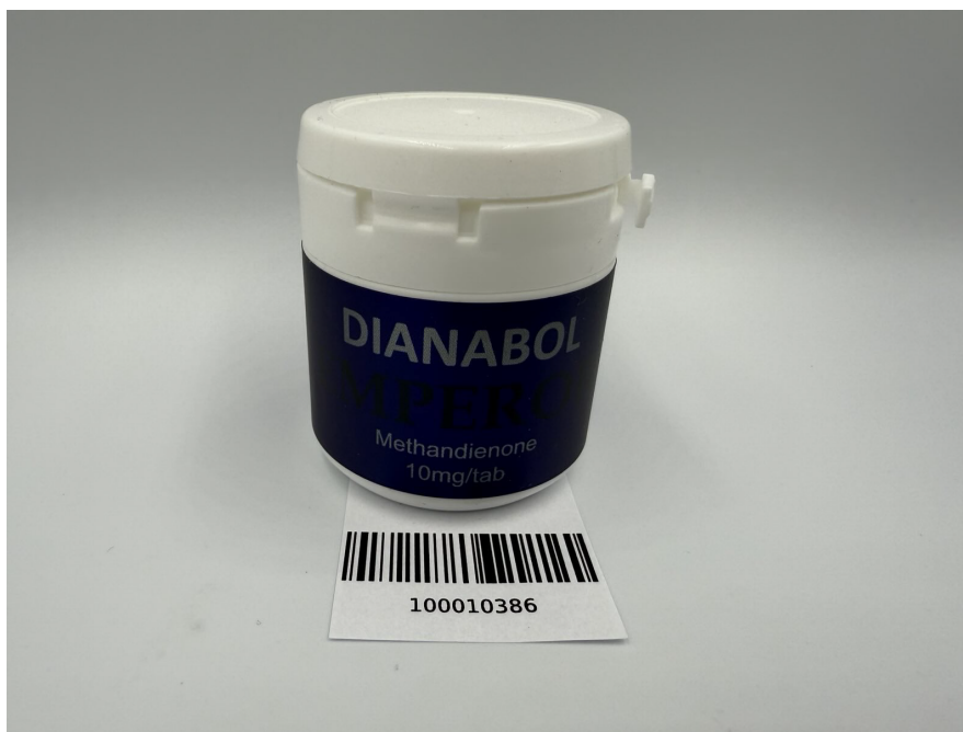
Photo of the test sample

The test sample was applied in the amount of 3 \mu l to the BioBasic 8 Thermo Scientific column. During the course of the analysis with the method a linear gradient in the solutions of H 2 O and Acetonitrile with the addition of 0.1% trifluoroacetic acid, a peak of the sought substance appeared. Its concentration, when compared to the reference chromatogram, is 9,70mg/tab. Height the measurement error is + - 0,05 mg. The actual state of the sample sent before the test is presented on the photo below