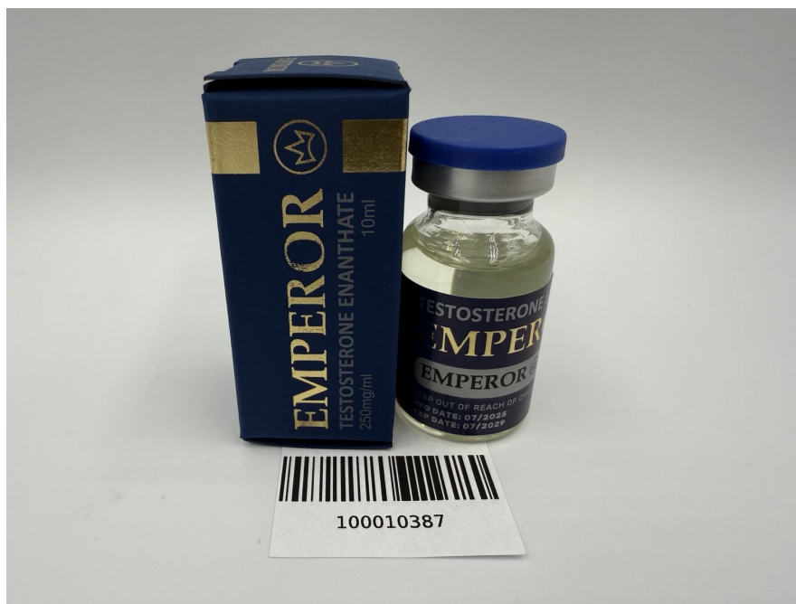
Photo of the test sample

The test sample was applied in the amount of 3 \mu l to the BioBasic 8 Thermo Scientific column. During the analysis with the method a linear gradient in the solutions of H 2 O and Acetonitrile with the addition of 0.1% trifluoroacetic acid, a peak of the sought substance appeared. Its concentration, when compared to the reference chromatogram, is 246,98mg/ml. The measurement error is + - 0,05mg. The actual state of the sample sent before the test is presented on the photo below